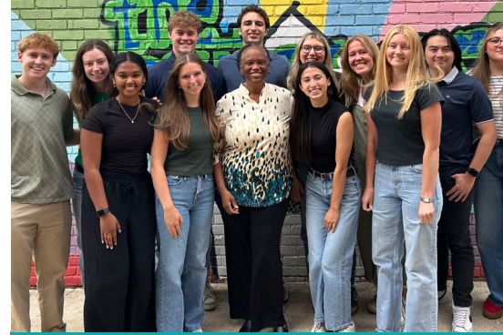
Students from Baylor University visit The House DC