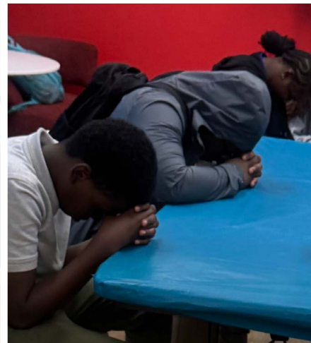
Freshman saying grace

Our 2025/2026 school year began with a day of staff prayer. We stepped away from the city to seek the Lord together, setting the tone for what we believe will be another powerful year of ministry with our youth.