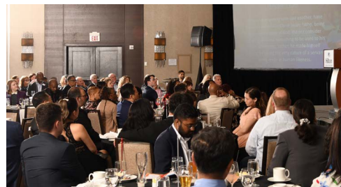
26th Anniversary Banquet