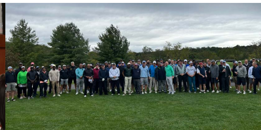
26th Annual Golf Tournament