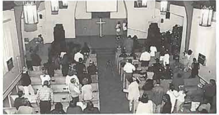
Sanctuary at SECF Church