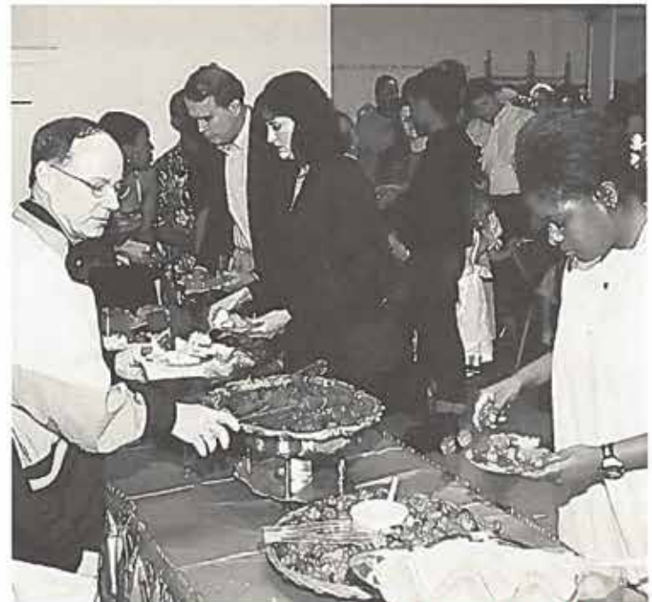
Volunteers honored at April 8th Celebration