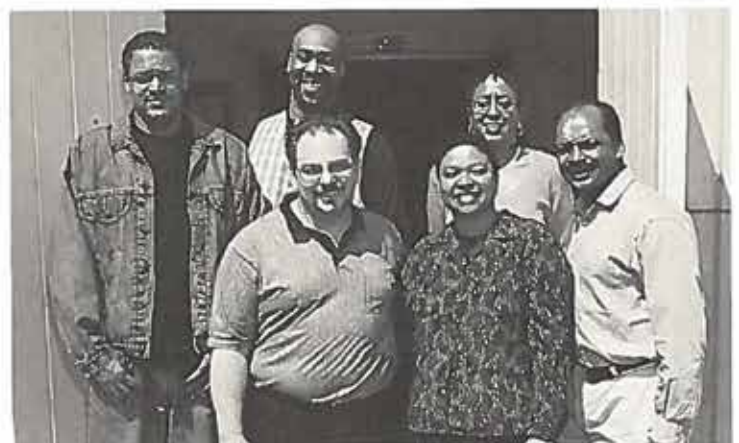
Some of the Staff and Volunteer Members from SECF Church