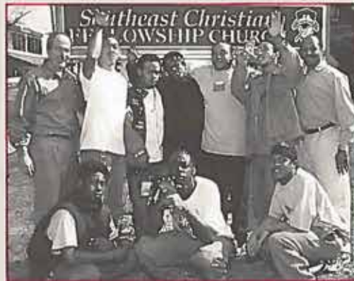
House Basketball Team and Coaches